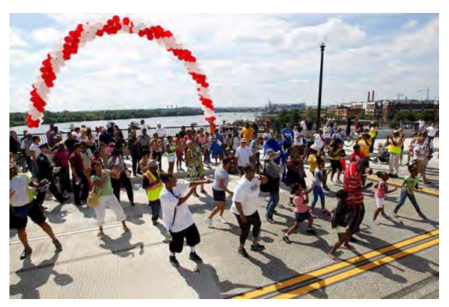
11th Street Bridge, Washington, DC. Photo courtesy of FHWA.

https://www.fhwa.dot.gov/innovation/everydaycounts/edc 4/connections.cfm