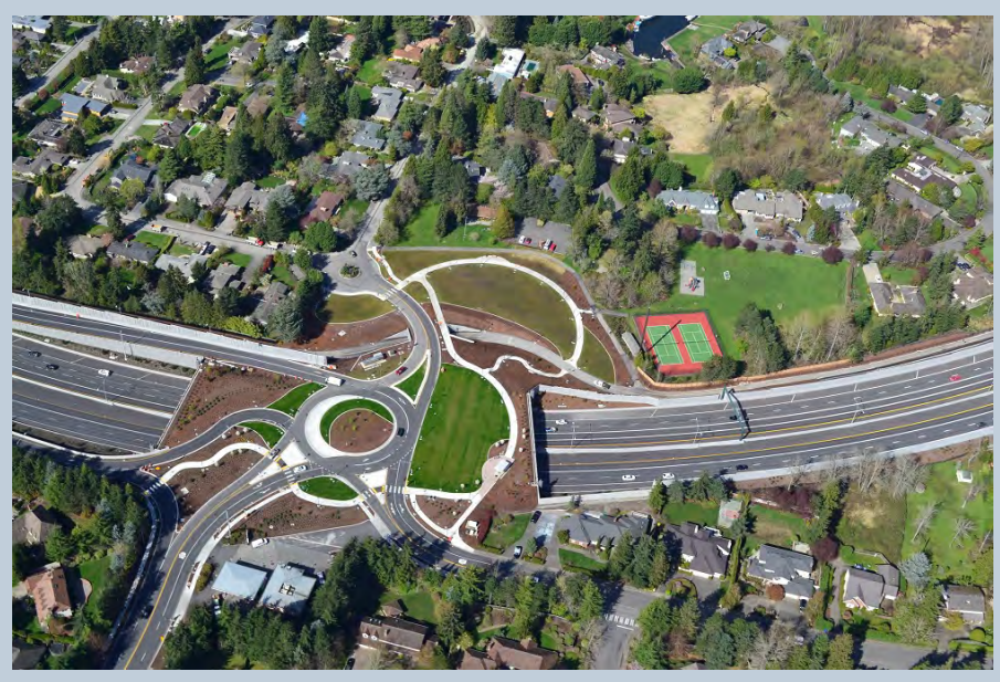
SR 520 Eastside Transit and HOV Project, Hunts Point, WA, photo courtesy of WSDOT.

Promotes performance management approaches for planning, project development, and design that support: